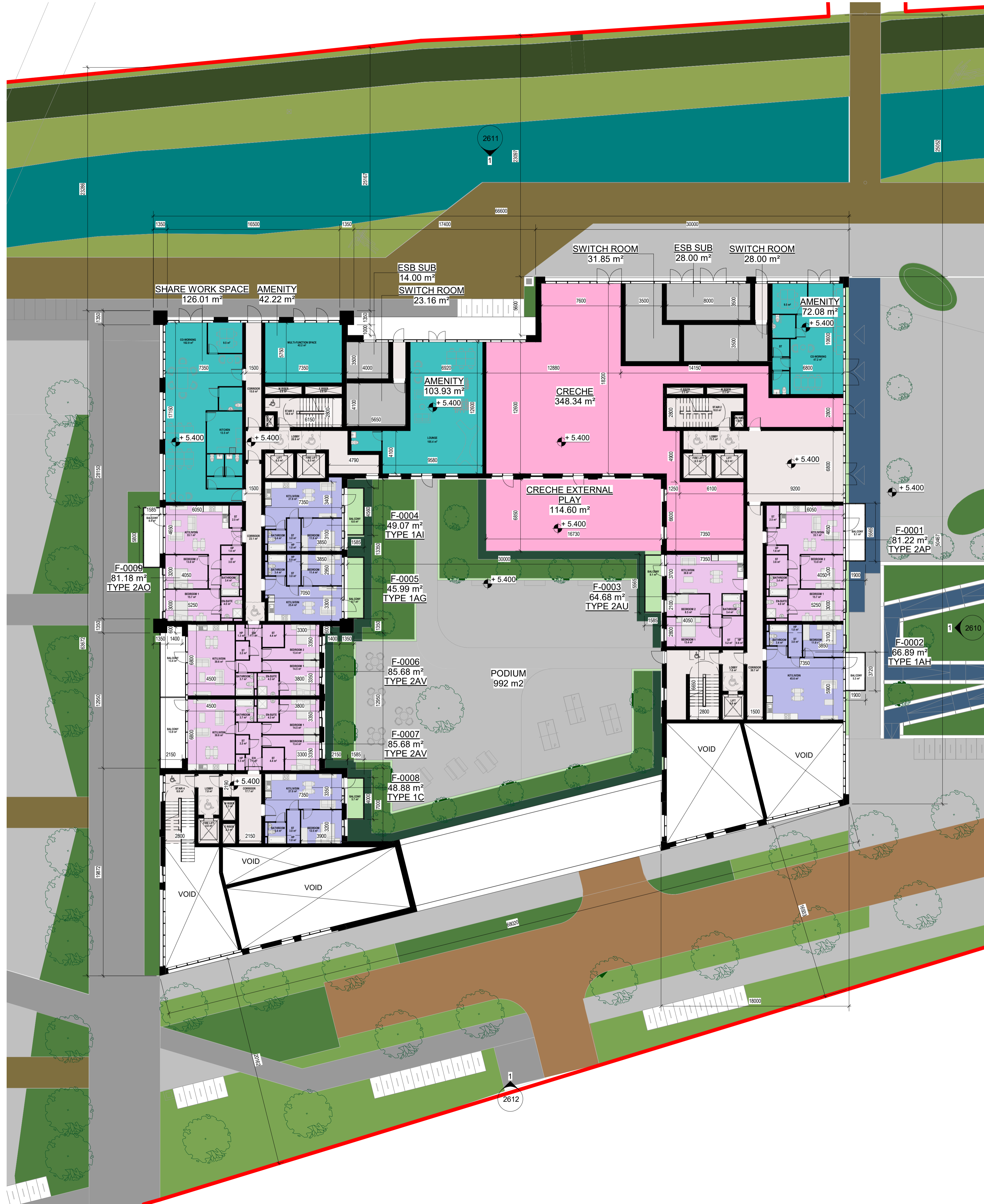
1 PLAN - BLOCK F - LEVEL 00 1:200

Please consider the environment before printing this sheet